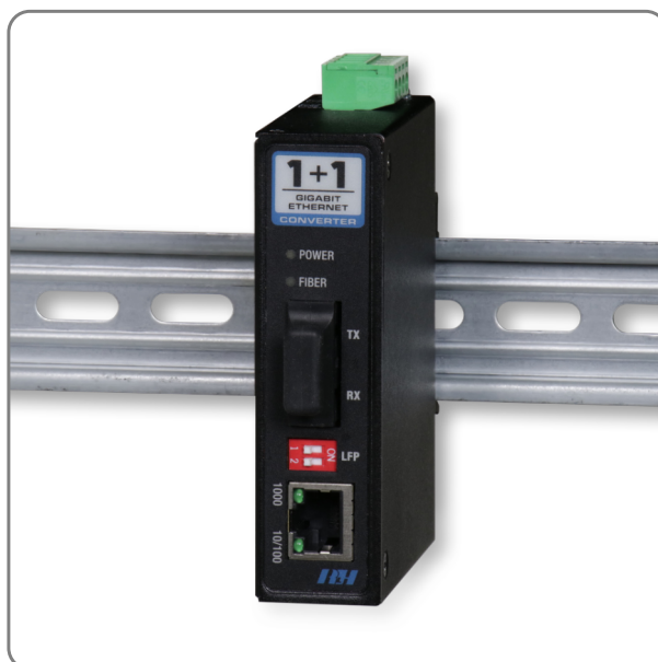
Industrial Gigabit Ethernet Media Converter