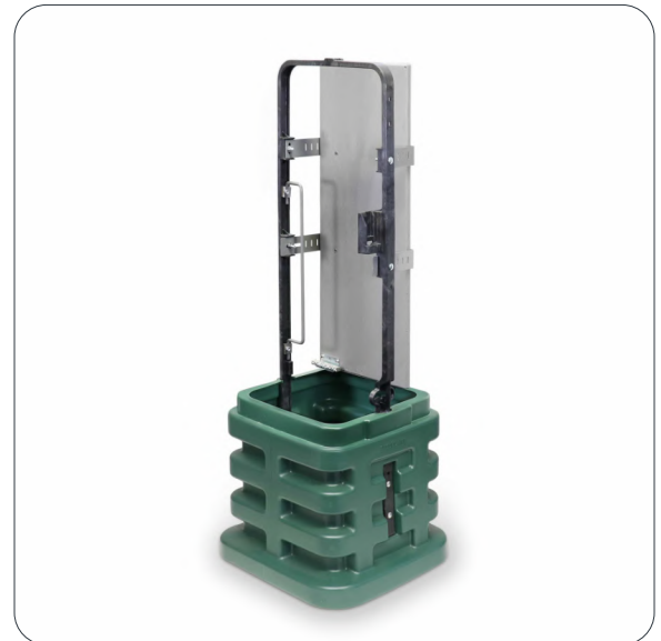
Open Showing Backboard