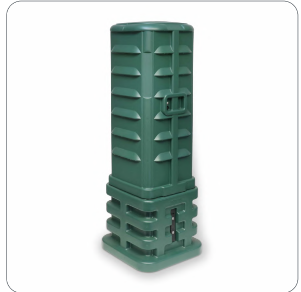
Small Semi-Buried Pedestal