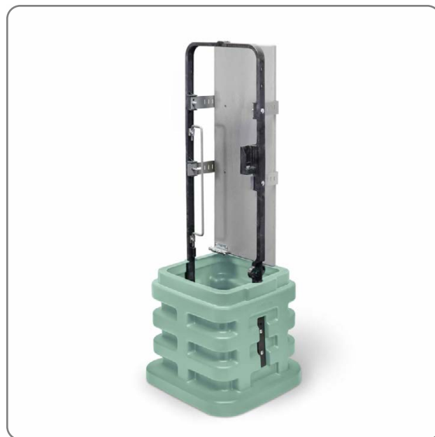
Open Showing Backboard