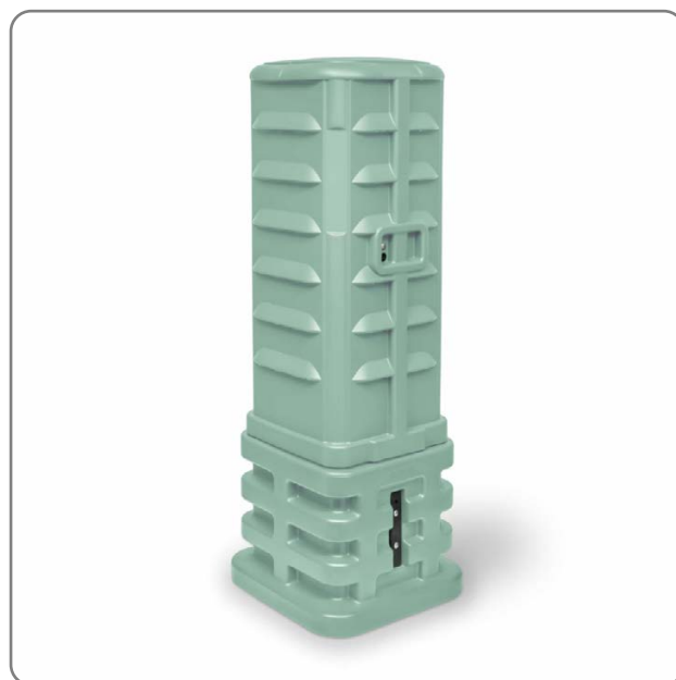
Small Semi-Buried Pedestal