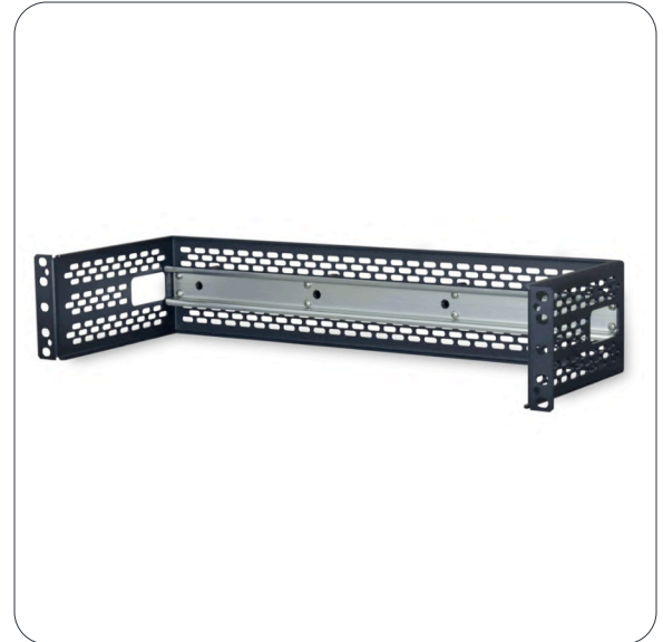
Rack Mount DIN Rail Bracket