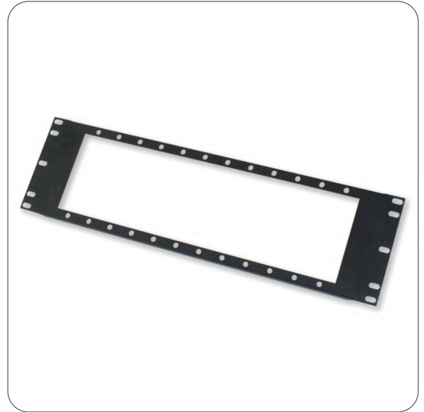
Rack Mount Adapter Plate Holders - 3RU

The 3RU rack mount models hold standard RLH Fiber Adapter Plates (black) sold separately. The Adapter plate holders are also compatible with any LGX foot print adapter plates.