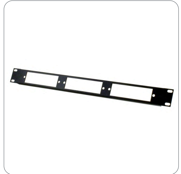
Rack Mount Adapter Plate Holders - 1RU

The 1RU rack mount models hold standard RLH Fiber Adapter Plates (black) sold separately. The Adapter plate holders are also compatible with any LGX foot print adapter plates.