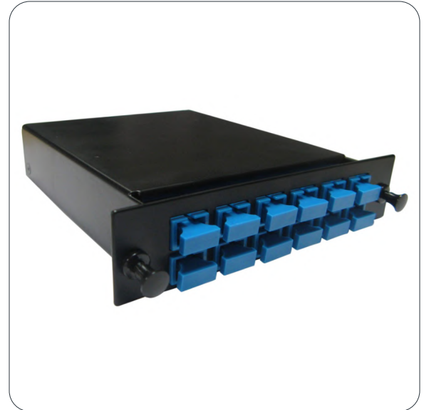
MTP/MPO Fiber Cassettes