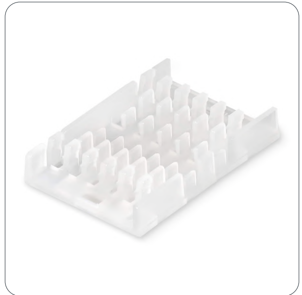
Mini Fiber Splice Holder