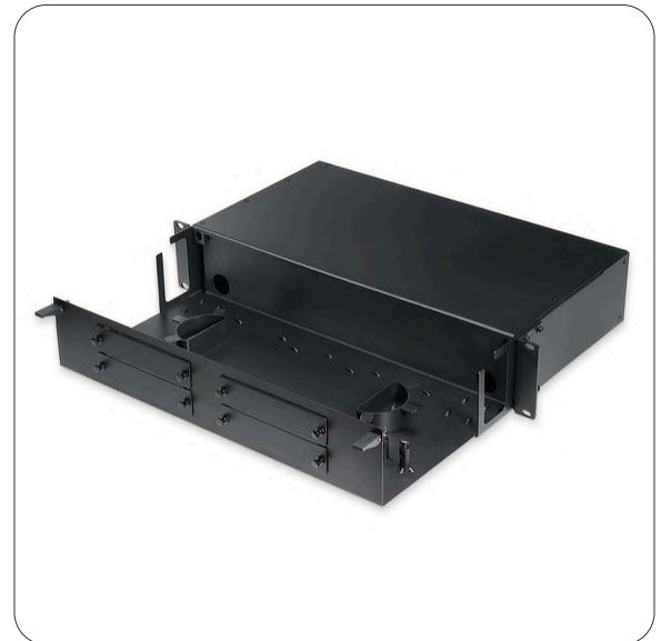
Manta 2RU Fiber Patch Panel (open)