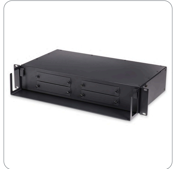
Manta 2RU Fiber Patch Panel (closed)