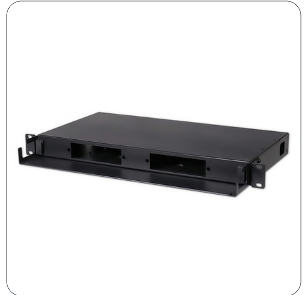
Manta 1RU Fiber Patch Panel (closed)