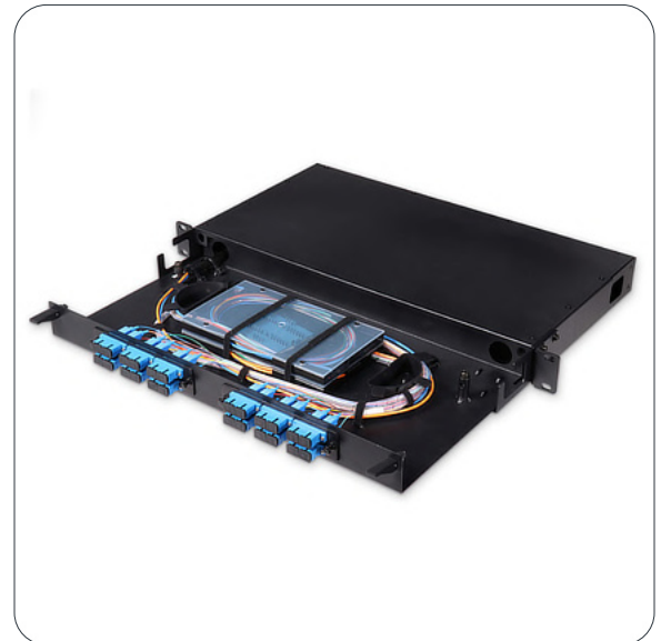
Manta 1RU Fiber Patch Panel (open)