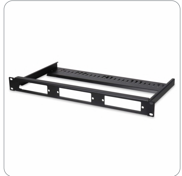
MAG-3 Fiber Adapter Plate Holder