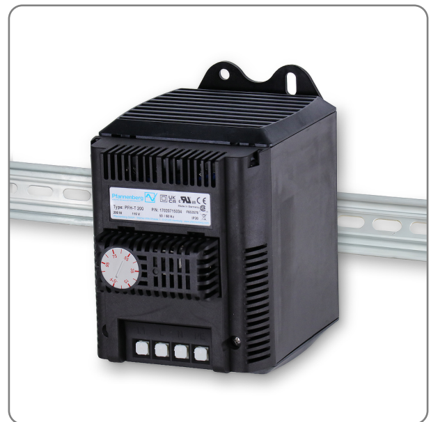
200W Heater on DIN Rail