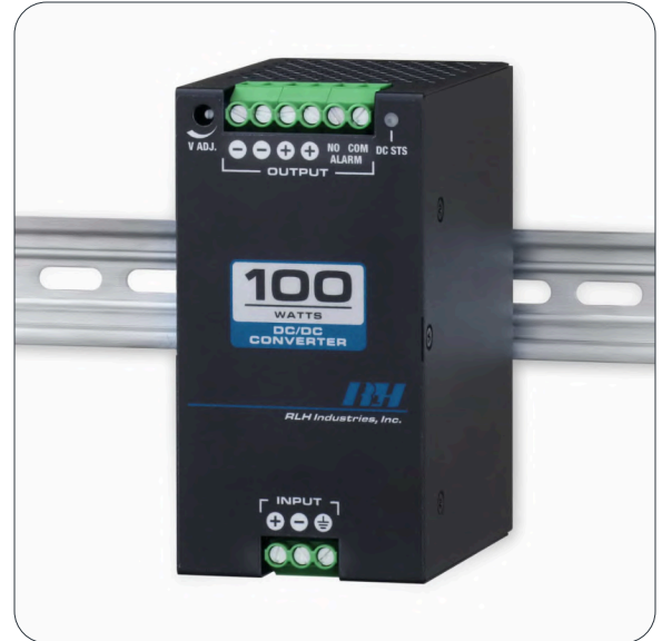
Industrial 100 Watt 130V to 12V DC/DC Converter

Supports a wide input voltage range and also allows for adjusting the output voltage to \pm 10\% of the rated output voltage. The converter has a bi-color LED indicator and a relay output to indicate power status and alarm conditions.