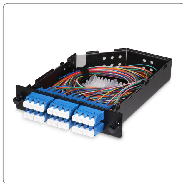
24 Fiber LC Quad Cassette

Fiber and adapter colors follow TIA/EIA-568-C.3 suggested color identification scheme. The cassettes are compatible with most RLH enclosures and patch panels.