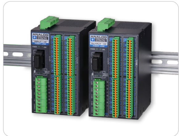
4~20mA & 32 Channel Contact Closure MAX System

Extends up to 32 contact closure alarms over fiber to the paired devices. A solid state relay output at the receiver device provides ultra fast response times.