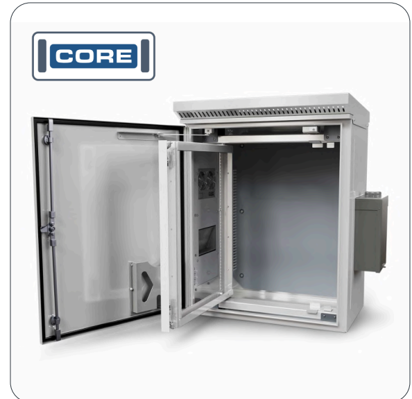
CORE enclosure with 2000 BTU air conditioning system and 70A load center