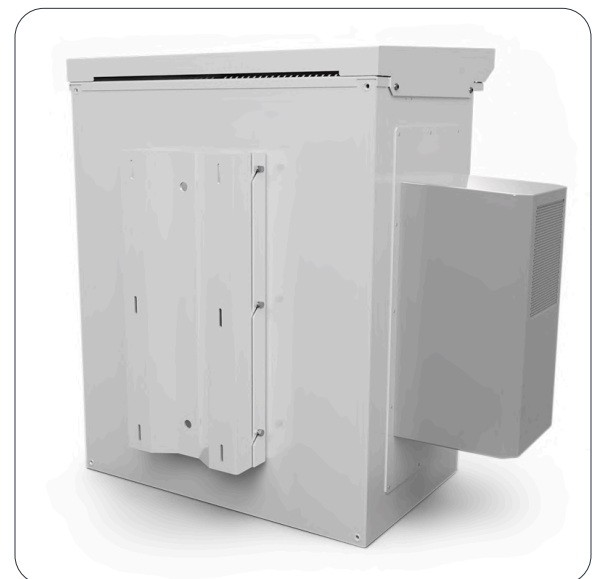
CORE Enclosure with Air Conditioner and Pole Mount