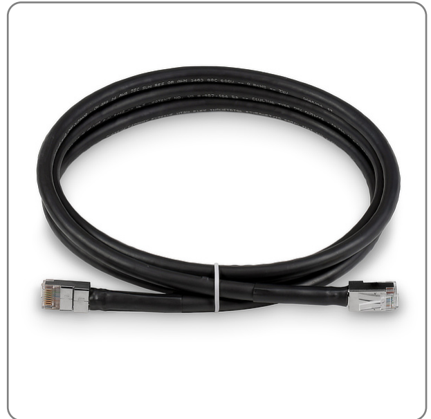
Outdoor CAT6A Shielded Patch Cord