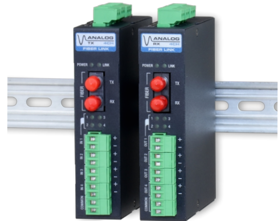
4 Channel Analog Data DIN Fiber Link System

Designed to operate over an extreme temperature range, providing reliability in harsh environments. It was designed and is made in the U.S.A and is covered by our Limited Lifetime Warranty.