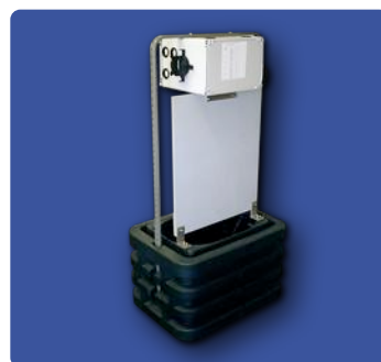
Shown with 8-card shelf installed