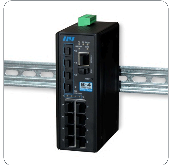
8+4 Managed Gigabit SFP Switch