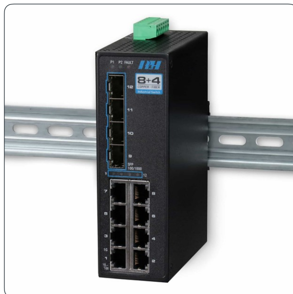
8+4 Port Gigabit SFP Switch

Our industrial switches robust features and construction meet the demands of a variety of applications, and are an ideal solution for a wide range of utility and automation environments.