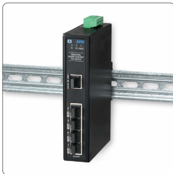
5 Unmanaged 10/100/1G PoE+ DIN View

Our industrial switches robust features and construction meet the demands of a variety of applications, and are an ideal solution for a wide range of utility and automation environments.