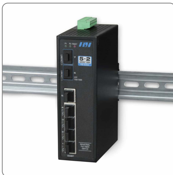
5+2 Gigabit SFP PoE+ Ethernet Switch

Our industrial switches robust features and construction meet the demands of a variety of applications, and are an ideal solution for a wide range of utility and automation environments.