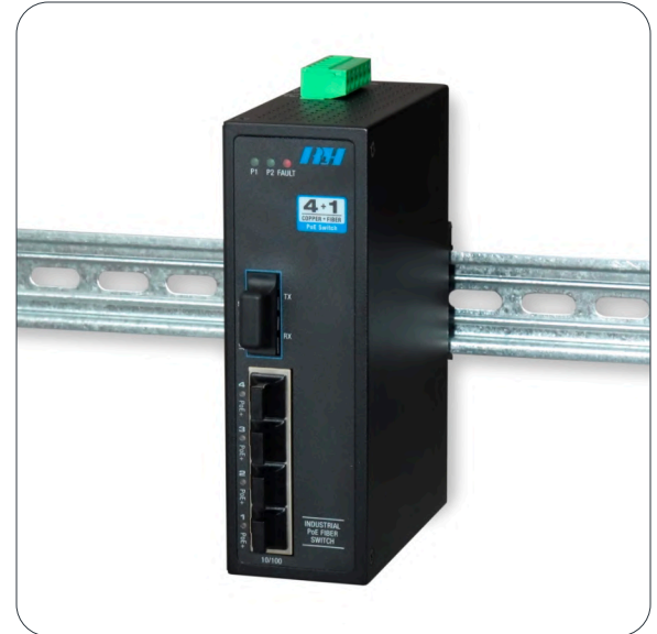
4+1 Fiber PoE+ Switch

Our industrial switches robust construction and features meet the demands of a variety of applications, and are an ideal solution for a wide range of utility and automation environments.