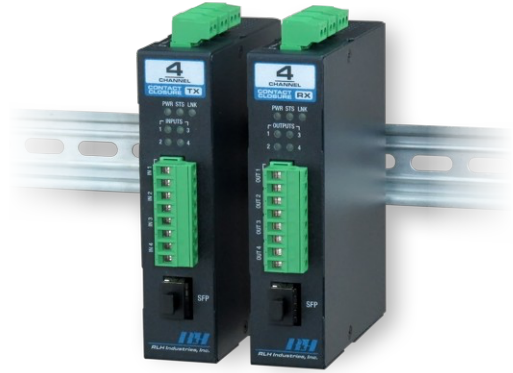
4 Channel Contact Closure SFP System