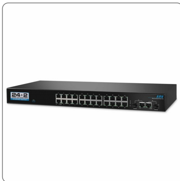
24+2 Unmanaged 10/100/1G SFP Rack Mount Switch

This switch provides 24 dedicated 10/100/1G (1000Base-T) ports and two additional 1000Base-T ports that share media access with two 100/1G SFP slots, enabling flexible copper or fiber uplink configuration. Its 1U, 19-inch rackmount form factor delivers a high port count while minimizing space requirements.