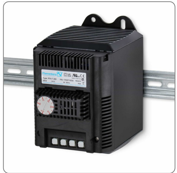
200W Heater on DIN Rail