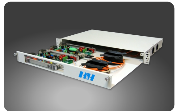
RLH 1RU Slimline Fiber Link Card Housing