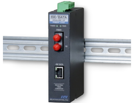
4 Wire Data with E&M DIN Fiber Link

This system transports one circuit of 4 Wire Data and supports E&M signaling. The devices can be ordered with dual fiber or single fiber transceivers. The 4 wire data supports constant transmission of voice frequency ranging from 300Hz-3,400Hz which is suitable for a wide range of radio and SCADA applications. This RLH Fiber Link system is designed and made in the U.S.A. and covered by our Limited Lifetime Warranty .