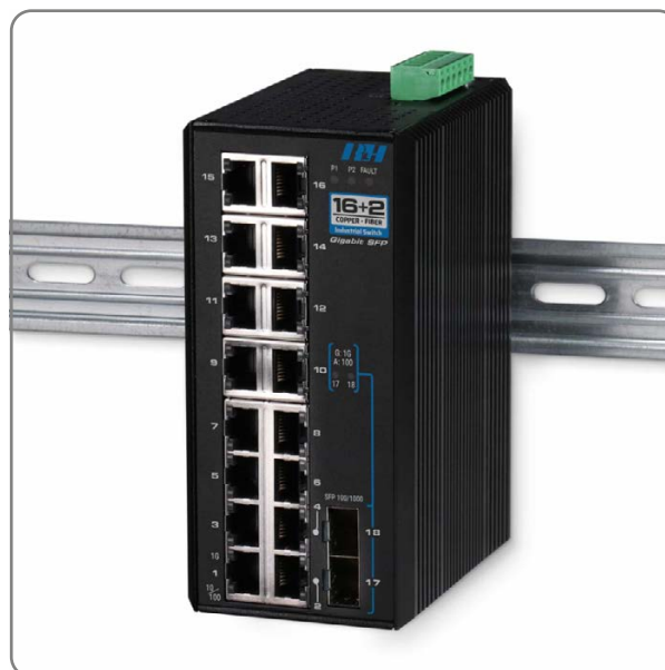
16+2 Unmanaged 10/100/1G SFP

RLH Switches are an ideal solution for a wide range of utility and automation network environments.