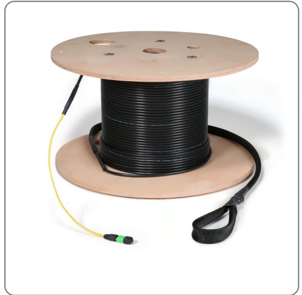
12 Fiber, MTP Cable Assembly with 1 pulling sheath