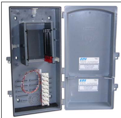
HOUSING WITH 8-PAIR COPPER TERMINAL BLOCK.