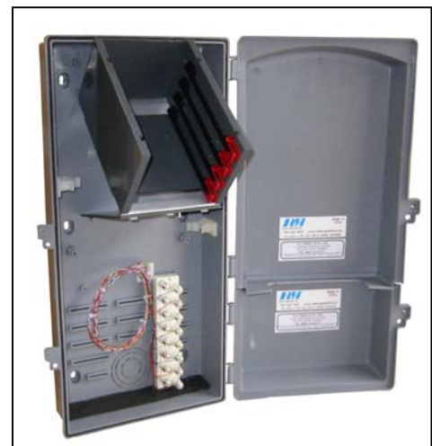
SWING OUT INSERT