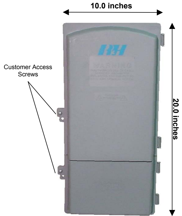
Depth of Enclosure=5.5 inches

Housing is mounted via (4) wood screws (provided). Fiber optic and copper cabling is ran directly into bottom of enclosure and sealed with a webbed gasket.