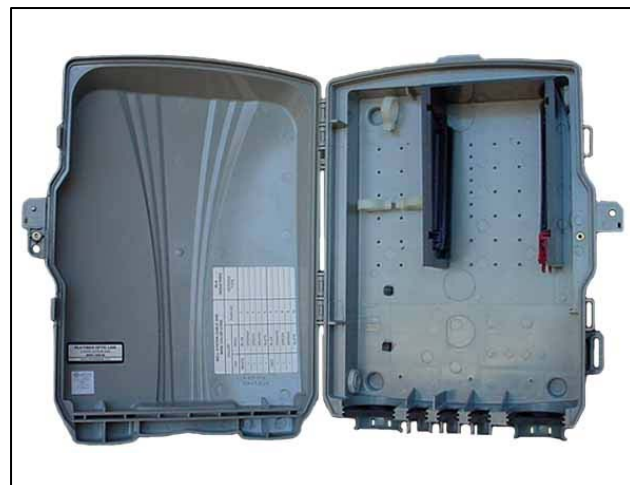
Dual Card Housing