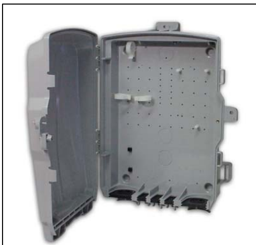
Single Card Housing