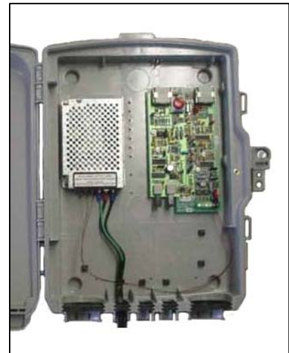
Housing with Power Adapter

Input Voltage Range: 100-240VAC or 110-330VDC Output Voltage: PA24: 24VDC @ 0.5A / 1.0A PA48: 48VDC @ 250mA / 500mA Operating Temp.: -40C to +70C (-40F to +158F) Connection: Terminal block