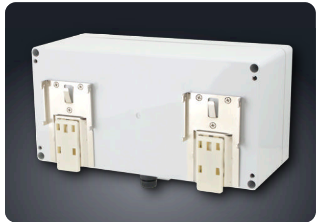
Rear view with DIN rail mounts