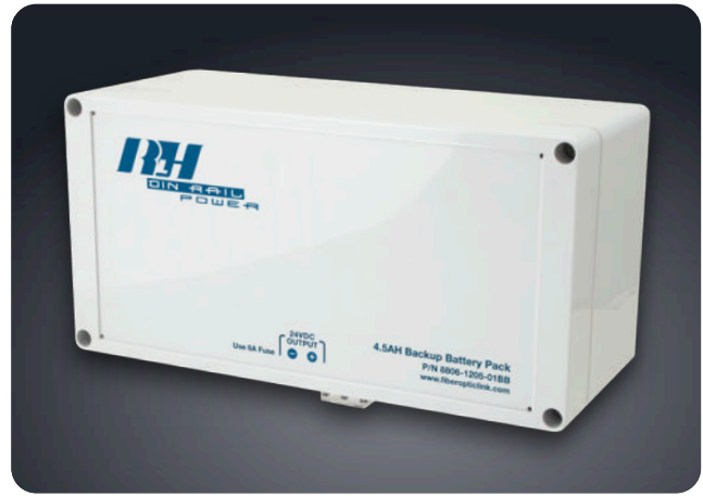
RLH 4.5AH DIN/Wall Mount Backup Battery Pack

Depleted and/or defective batteries are field replaceable by qualified personnel. RLH batteries have a 5 year warranty. Refer to ordering information for replacement batteries.