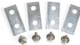
H-fixture Hardware (Included)