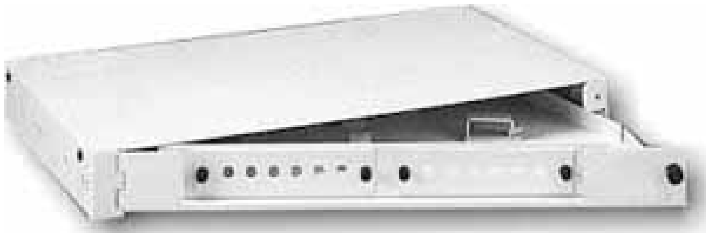
RLH-12RST-01 Rack Mount Enclosure/Patch Panel with ST Connectors for 12 Fibers 19" or 23" Mounting Dimensions: 1.87"H x 17"W x 9.75"D Weight: 13 Pounds