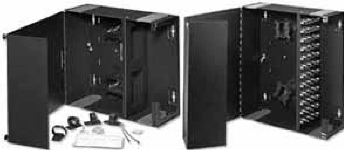
RLH-24WST-01 Wall Mount Enclosure/Patch Panel with ST Connectors for 24 Fibers Dimensions: 9.25"H x 8.5"W x 3"D Weight: 11 Pounds