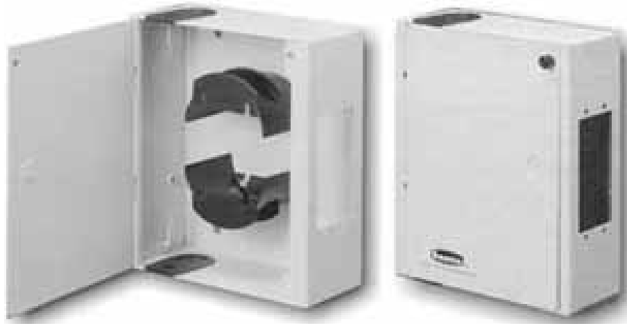
RLH-12WST-01 Wall Mount Enclosure/Patch Panel with ST Connectors for 12 Fibers Dimensions: 10.2"H x 12"W x 3.5"D Weight: 10 Pounds